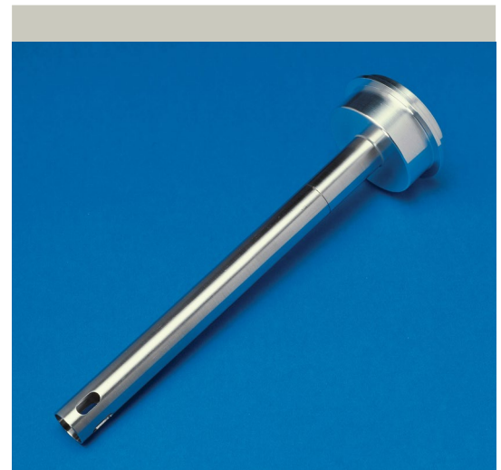
FIGURE 1. Shielded specimen holder port.

formvar were plasma cleaned with and without the protective shield. 1 Without the shield, the mean rate for complete removal of a film was